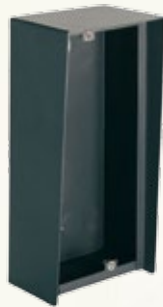
HBP-T Surface mounting